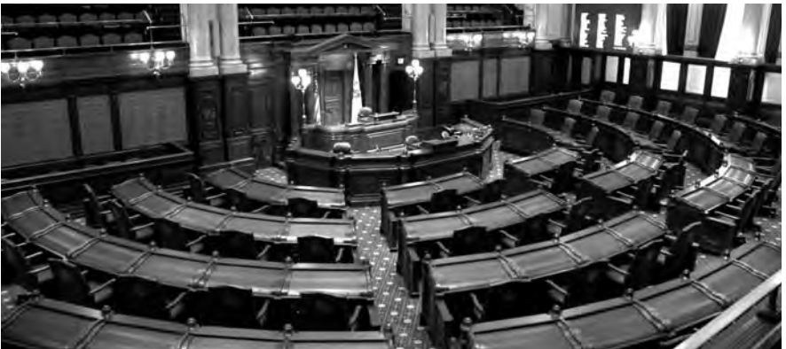
Illinois Senate chamber.

For a complete explanation of how a bill becomes law, visit www.ilga.gov .